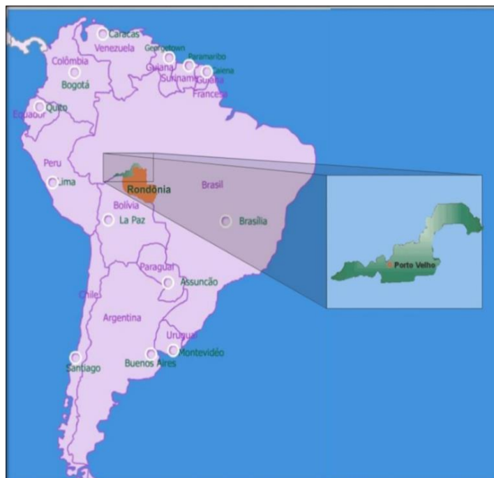
Figure 2. Infographic of the Porto Velho city, capital of Rondônia state.

The city of Porto Velho, capital of Rondônia state, is situated on the right bank of the Madeira River, seven kilometers from Santo Antônio waterfall, as demonstrated in Fig. 2. According to the data found at the Brazilian Institute of Geography and Statistics site, the estimated population of the Municipality of Porto Velho for the year 2011 was 435,732 persons distributed between urban and rural areas. By 2015 it had an estimated population of 502,748. In 2012, agribusiness is the second most important economic sector accounted for 20.5% of the Gross Domestic Product of the State of Rondônia, and Porto Velho is the second most important city that contributed with this percental, which highlights the importance of this economic sector in the region.