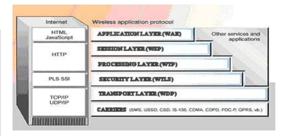
Figure 2. WAP Architecture [5].

WAP has an architecture for data transferring that resembles OSI layers model (Figure 2). In this architecture the lower layer presents some functionalities to the layer above it. Consisted of only five layers, both applications and protocols reside in every layer of WAP model. These layers are Application, Session, Processing, Security and Transfer when counted downwards. Application developers are especially interested in viewing language WML and Script language WMLScript that are located in Application layer.