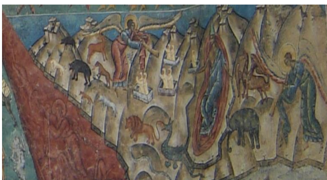
Fig. 7 Resurrection. Voronet. Detail

Regarding the sources of inspiration, if at Voronet a number of local elements are added to the specific Byzantine character, at Michelangelo one may find influences coming both from the eastern painting, starting with Torcello, to which other monuments in the area add up, and from the north-western and western one (Von Einem, pp. 178-184).