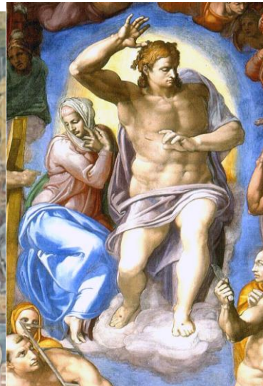
Fig. 4 Detail. The Sistine Chapel