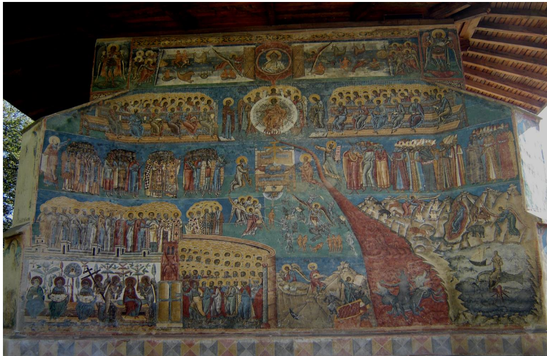
Fig.1 The Last Judgment. Voronet

The scene follows to a great extent Byzantine iconography. The composition is clear, the groups of characters are organized, individualized, one being able to easily see each register separately. Everything is rendered on a blue background which, over time, has given rise to the name of Voronet blue . It attracts the specialists' attention due to its resistance to quite tough climatic conditions, which demonstrates a particular artistic technique employed by the artists of the time (please see Istudor, 2009, pp. 211-229).