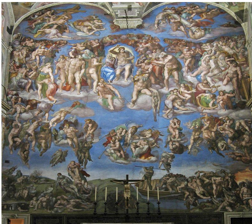
Fig. 2 The Last Judgment. The Sistine Chapel. Michelangelo.

The scene follows to a great extent Byzantine iconography. The composition is clear, the groups of characters are organized, individualized, one being able to easily see each register separately. Everything is rendered on a blue background which, over time, has given rise to the name of Voronet blue . It attracts the specialists' attention due to its resistance to quite tough climatic conditions, which demonstrates a particular artistic technique employed by the artists of the time (please see Istudor, 2009, pp. 211-229).