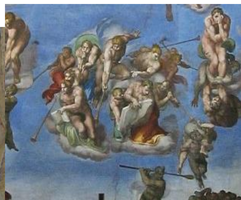
Fig. 8 Resurrection. The Sistine Chapel. Detail