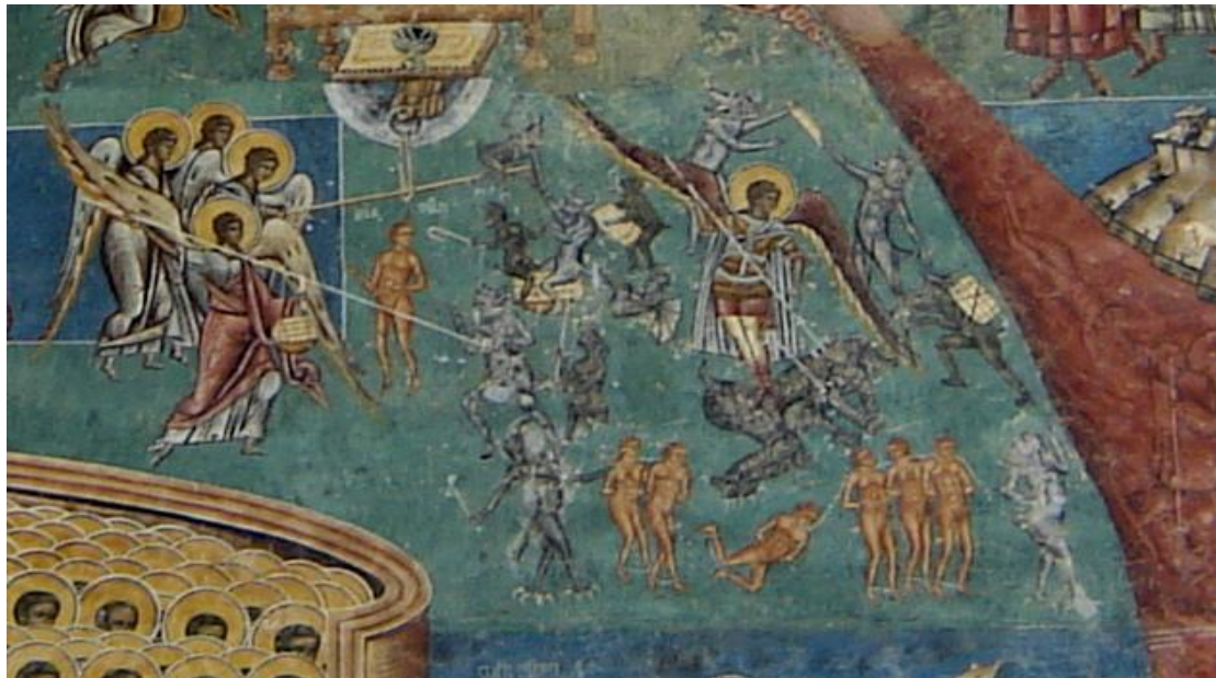
Fig. 12 The Scales of Justice. Detail

It is presented in the form of a hand, believed to be God's hand, holding the scales to weigh the sins. The angels, led by the Archangel Michael, cast out the demons that pull the hook to balance it in their favour, so as to steal as many souls as possible. The naked bodies of the sinners are led in chains to hell, to be tormented in the river of fire from the right (Vătăşianu 1974, p. 27). There awaits the dragon that swallows Judas, Christ's betrayer.