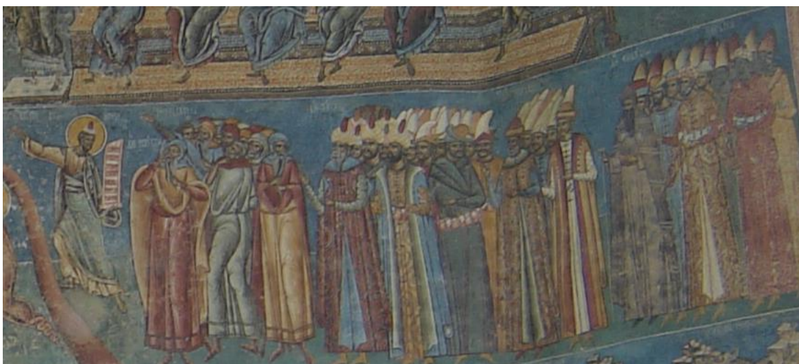
Fig. 13 Groups of Hebrew, Turks, Tatars and Armenians. Detail