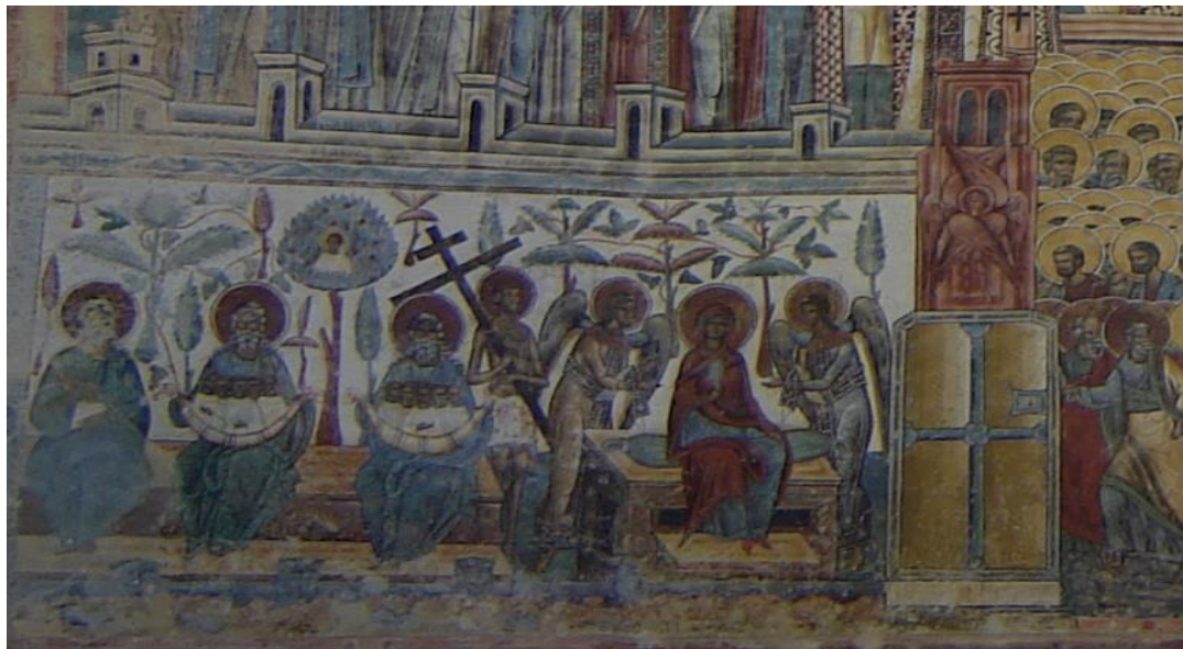
Fig. 15 Gate of Heaven and Heaven. Detail