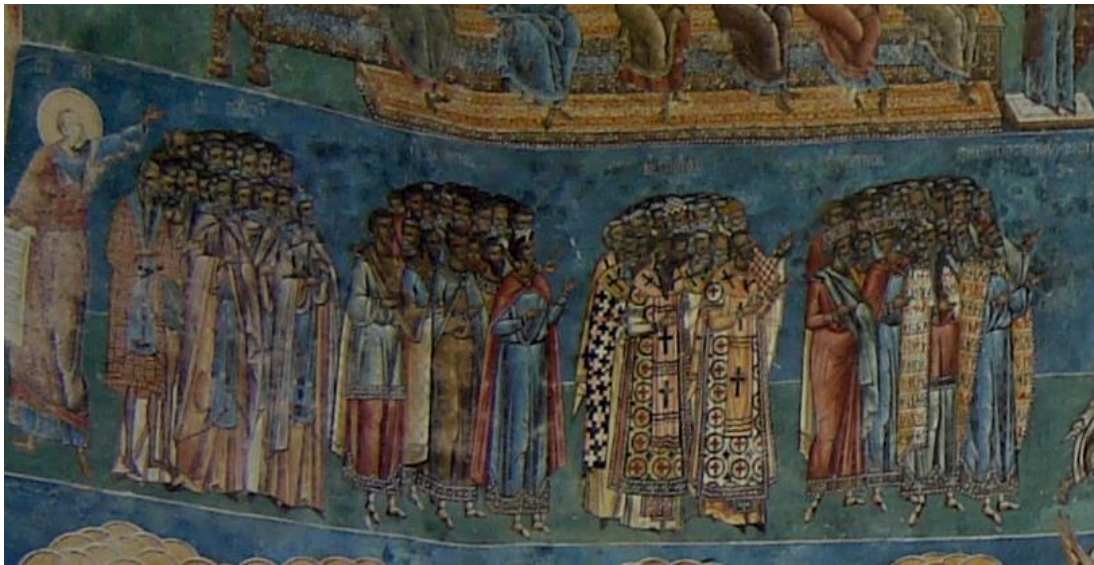
Fig. 14 The Groups of the Redeemed. Detail

Behind the gate is painted heaven, where one may notice, on a white background, specific to its representation, amidst the vegetation, Mary's face with two angels on her sides. Along comes the good thief who carries his cross, then the patriarchs Abraham, Isaac and Jacob, holding the souls of the redeemed in their lap, in traditional towels (Fig. 15) (Vătășianu, 1974, p. 27). Among the vegetation there appears a fruit tree, the Tree of Life, in the middle of whose crown the image of Christ is highlighted. In relation to the Erminia, here the virgins groups are not present.