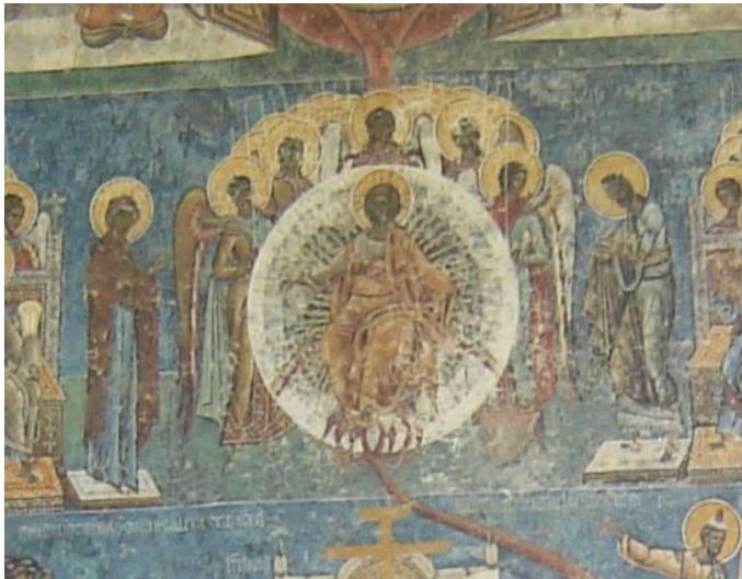
Fig. 3 Deisis. Voronet. Detail

In the Sistine Chapel, on the altar wall, six years before the Moldavian work, Michelangelo gave birth to a monumental, open and dynamic (Fig. 2) composition, one with a great dramatic load. Just like in the case of the Moldavian work, Michelangelo's work was also painted on a blue background. The Italian artist's work is not organized as that of Voronet, in several registers, but it creates the impression of a vortex which starts from the raised hand of Christ.