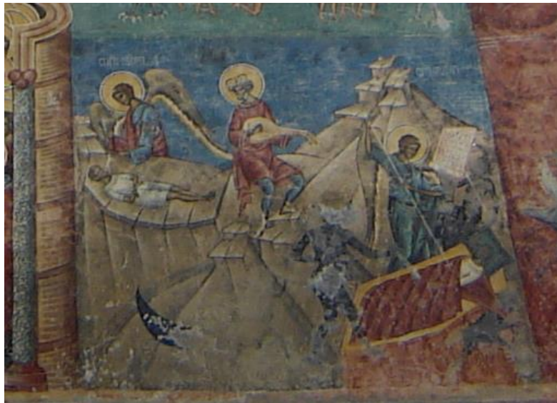
Fig. 16 Death of the Poor and Death of the Rich. Detail

In the Sistine Chapel, Michelangelo introduced contemporary characters, such as Biagio da Cesena. Giorgio Vasari mentions the moment when the Pope asked for his opinion about the scene that was going to be ready shortly. The master of ceremonies replied unfavourably, cataloguing the painting as "more than wanton, placed in a so noble spot and that it was not suited to the chapel of the Pope, but to a bathroom or an inn" because of the nudes. In order to avenge on him, the painter introduced him in the work, in the upper, down corner, in hell, in the guise of Minos, rendering him naked with a snake around his foot and with many demons around him (Vasari, p. 217, vol. 3).