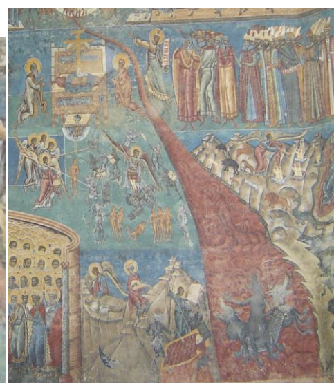
Fig. 11 The River of Fire. Detail