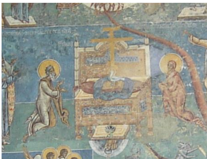
Fig. 10 The Hetoimasia Throne. Detail

There are several elements missing from Michelangelo's Judgment that, nonetheless, can be found at Voronet, such as the Hetoimasia Throne (Fig. 10): pigeon, gospel, cross, nails, framed by Adam and Eve kneeling down; the river of fire that springs from Christ's feet and flows to the right corner of the composition, in which the sinners eaten by the dragon that awaits them below hurtle down (Fig. 11), and under the Hetoimasia Throne there hangs the scales of justice (Fig. 12).