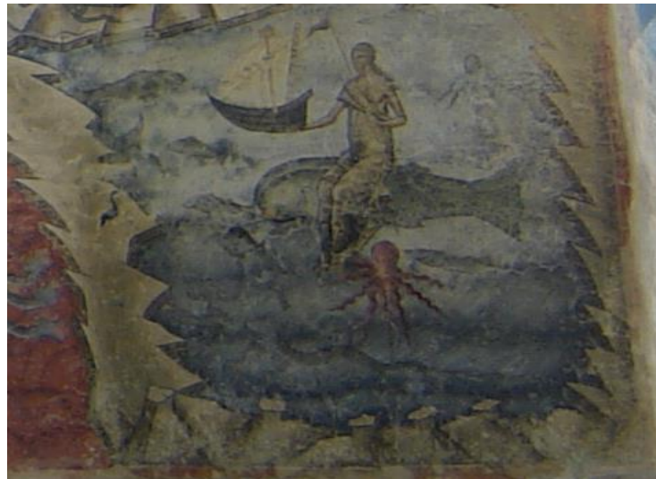
Fig. 9 The Allegory of the Sea. Voronet. Detail.

Below, the allegory of the sea is highlighted, expressed by a woman sitting on a dolphin with a ship in her hand. Around her, birds and fish release the dead (Fig. 9) (Vătășianu, 1974, p. 27). In the Sistine Chapel, the time is announced by a group of angels who seem as if floating on clouds, blowing down the trumpets to make themselves heard by the dead. Two angels hold a book in their hands as a symbol of awareness of their sins. Their faces express fear, horror, the eyes are bulging, trying to frighten those who watch them, and the positions of the agitated, twisted bodies deepen the dramatic nature that characterizes the whole composition.