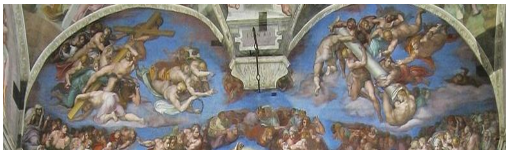
Fig. 18 The Sistine Chapel. Upper Register. Detail