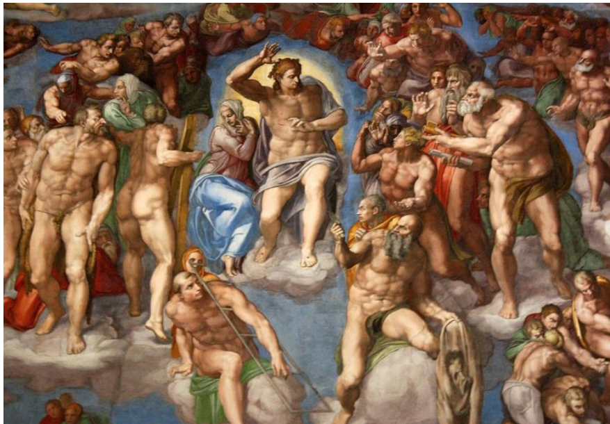
Fig. 6 Detail. The Sistine Chapel

compared to the Byzantine iconographic tradition.