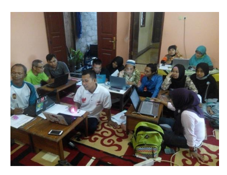
Fig. 2 Enthusiasm of Training Participants (Source: MPM Muhammadiyah document 2015)

Situs of www.kedaimu.com is a container for MPM Muhammadiyah's target groups to market the products they have produced online. According to Mr. Waluyo as a computer training participant, this activity is very beneficial for him and also at the same time can provide wide access to the sale of their products to the online world.