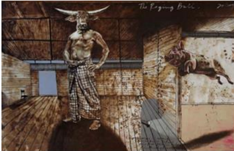
Fig. 1.3: The Raging Bull, 2015.

Efforts to further improve the guidelines in detail are an integral effort in the current visual art scene. This has to be done to prevent Malaysian visual art artists, generally and Muslims specifically from breaching the Islamic Shariah laws in future production of their artwork. Malaysia as an Islamic country has to improve the existing guideline with regard to visual art and others too according to current demands.