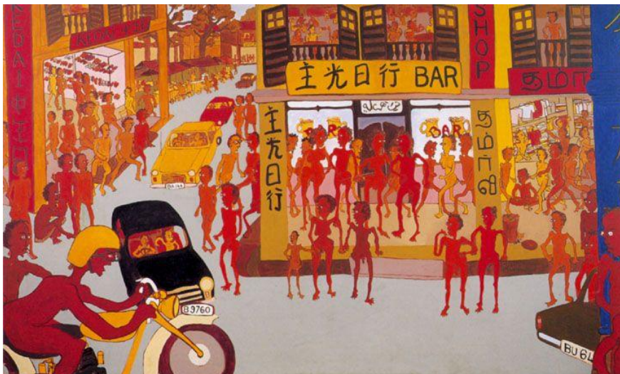
Fig. 1.1: Kedai-kedai, 1973.

Generally, in Malaysia, many artists often produce artwork in the Western visual language. Malaysian education during its post-independence years transformed from the traditional or madrasah and vernacular system to modern education from the West. As a result, many local students went to pursue their studies abroad to obtain formal education from the foreign countries. One of the fields which was part of the main choice of education in the West was visual art field. This situation was apparent when there was scholarship offered from the state governments and various foreign scholarships for those who were interested to take up visual art studies. Malaysian artists who received formal education from the west through scholarship were Sulaiman Esa, Syed Ahmad Jamal and Redza Piyadasa (only to name a few). As a result, changes in the visual art movement in Malaysia could be seen in the artwork style which used Western visual language (Mulyadi Mahamood, 1993). Nevertheless, the Malaysian visual art scene suffered a conflict when there were some artwork exhibited clearly contrasted with the local society's visual culture. Such situation occurred among the Malaysian visual art scene because it was still in the process of assimilation or adoption of Western visual culture into their artwork.