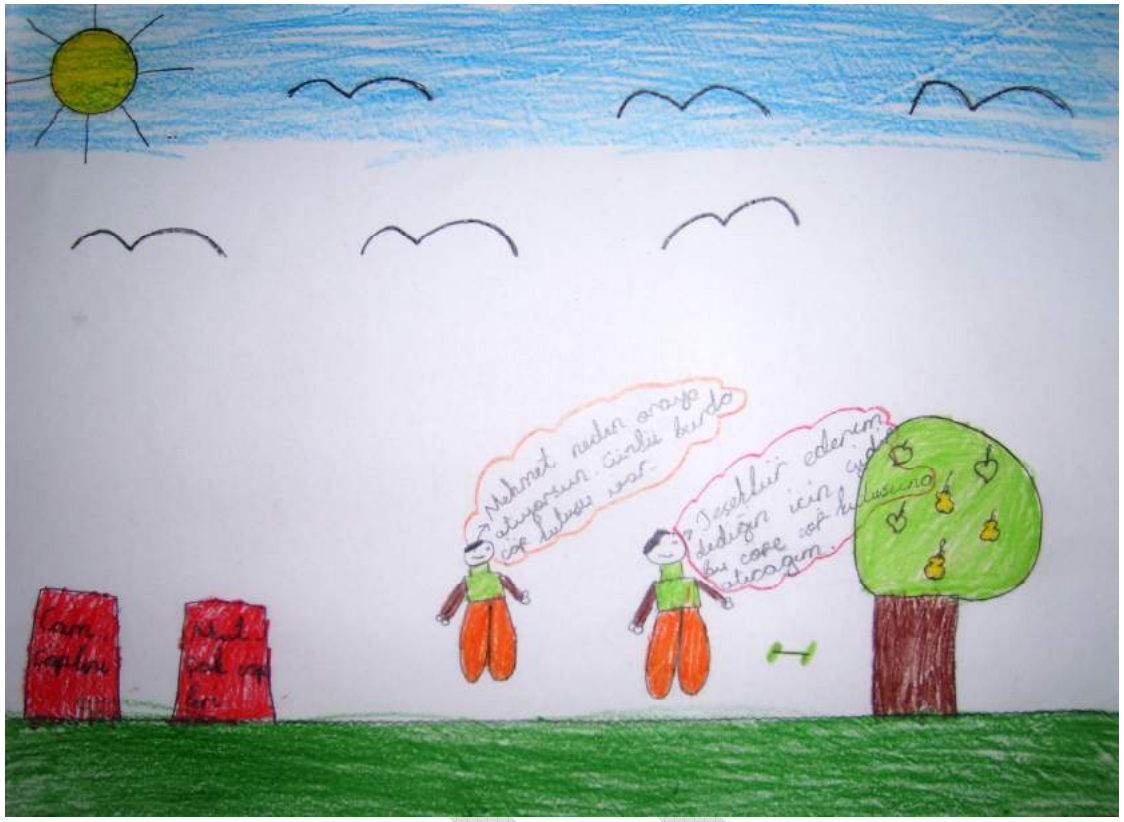
Picture1. The person, warning the individual who is throwing garbage to the floor

2) Collaboration Perception: When sample cases to be possessed by active citizens in terms of collaboration that was tackled in the drawings are studied, it was determined that "the individual who helps persons in their surroundings" was drawn more in comparison to other behaviors (12 themes, 12/110). In addition, it was seen that "person helping organizations such as associations and trusts" came after this (5 themes, 5/110).