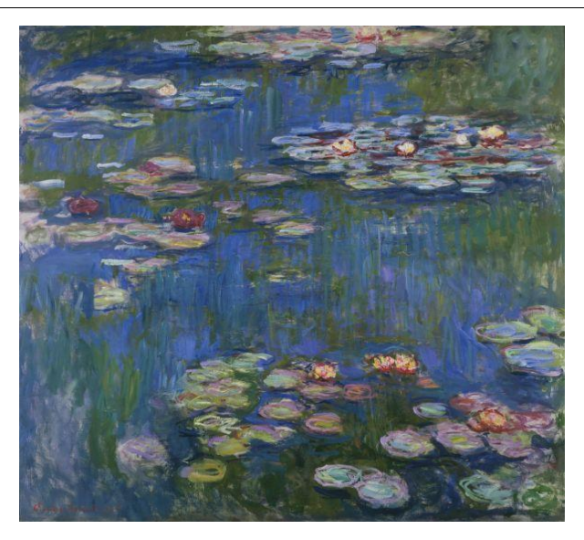
Figure 2: Claude Mont, Water Lilies, 1916, Oil paint on canvas, 200.5 cm x 201 cm, Collection No. - P.19590151, (Source: Website The National Museum of Western Art, Independent Administrative Institution National Museum of Art, 2011).

Allah SWT created a multitude variety of flora and fauna for the benefit of human life in the world. When the process of photosynthesis ceased, green leaves will turn from yellow to red to brown, which finally dry up and subsequently fall to the ground. In some trees, all the leaves fall leaving only bare twigs, branches and trunk. In region that experience seasonal changes, this occurrence saves the tree from being broken due to the weight of snow that soon follows in winter. The tree did not in fact die it will flourish again with new leaves and flowers in spring. This change in seasons is thus, marked with the changing of colours and the trees condition. Again, colours play a vital role in informing the changing of the seasons. Similarly, designers too select and apply colours in the process of creation. Fashion and textile designers search for information, process and analysed it to produce creative products. Hence, a pattern is created that resembles colours and visual integration with effects of leaves and grass on a military camouflage uniform. It functions to conceal the wearer from the view of enemies in the forest or jungle.