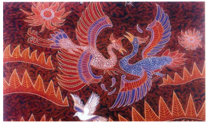
Figure 3: Hashim Hassan, 1987, 'Intruder', Acrylic, 143x143cm. (Source: Muliyadi, 2007, p.61).

The sight of man is not limited only to the eyes. It is also complemented by the other senses such as touch, smell and taste. For example, the growth of a plant can be seen from the start on its seed that grows shoots and leaves. These develop into a trunk, branches, flowers and fruits. Altogether, the experiences of touch, smell and taste further enrich the experience of sight.