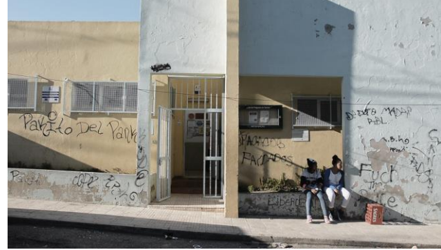
Fig. 2-3: Bairro da Estrada Militar do Alto da Damaia and Loja Social. Video frames (Gorgel Pinto, 2015).

The project was developed in partnership with a local association called Loja Social, in which two courses were created: in a first phase, a training course in the field of computer literacy, open to the participation of adults from the local population and, subsequently, another action on pinhole photography, which was destined to younger people (Fig. 4-5). The developed sessions, under each training, were restricted to a small number of participants, taking into account that logistical conditions were limited. The project counted with the collaboration of some trainees of a professional course in the field of multimedia, from a local high school, that gave assistance to the production.