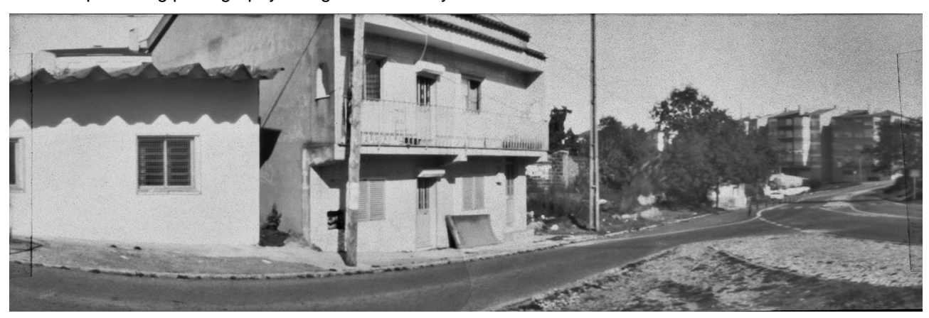
Fig. 6: Pinhole photography from the neighborhood (Gorgel Pinto, 2015).

Bearing in mind the evaluation of the project, some interviews to the participants were conducted, as well as to other residents and employees from the social institution. Generally speaking, the people consulted considered the social support useful, since it values, directly, those who participate on the educational activities and, indirectly, the remaining residents. They also mentioned that this type of activity contributes to the neighborhood civic development, counter-cyclically with clandestine movements that regularly occur in place. With regard to the individuals involved in the learning, they also felt that the support received was useful for their daily life and it would be important to have the continuity of the activities. These people believe that participating in educational activities has positive effects on health, particularly in reasoning and memory. The younger participants, in the pinhole photography action (Fig. 6), reported that they would like to continue practicing photography in organized weekly sessions.