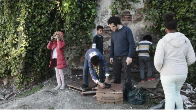
Fig. 4-5: Lessons for adults and workshop for youngsters. Video frames (Gorgel Pinto, 2015).

In the participatory sessions of the course, video footage, photographs, audio recordings and texts were collected, as well as other kind of references, to be aesthetically worked and integrate the final representation piece. With respect to the audio recordings, the interviews of some residents in the neighborhood stand out. It is intended that the set of multimedia pieces that represent the social art project, assume a contemplative character that confronts the viewer and refer him to a proper meaning in a space of numerous referents. At the same time, it is the illustration of a concrete social design project, with much focused methodologies and objectives with regard to the cultural appreciation of the community concerned.