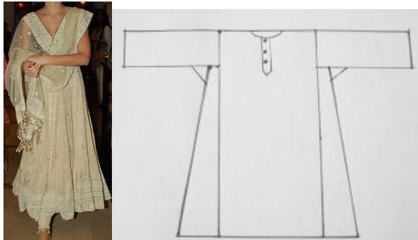
Fig. 5 Anarkali Suit and Lucknowi Kurta with Gusset