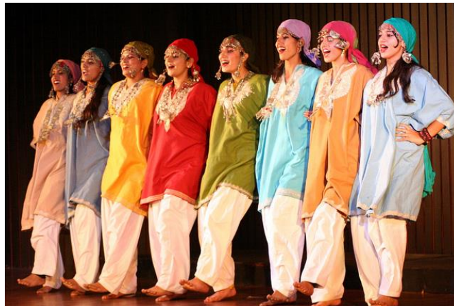
Fig.4 Kashmiri Pheran and Salwar

The traditional dress of Jammu & Kashmir is unique in the whole Indian Sub-Continent as it comes from various cultural backgrounds. The Kashmiri people usually practice Islam, Hinduism and Buddhism. Both Kashmiri Hindu and Muslim women dress up in Pheran - a loose Kalidar Kurta usually till knee length or longer. Salwar is worn as the lower garment. Pheran is considered a combination of Indian and Iranian clothing. The Pheran for Kashmiri women is more stunning and graceful with the heavy embroidery and has broad sleeves. The neckline, slits, sleeves and the hemline are elaborately embroidered. They have a very distinct way of wearing the scarf. The scarf is secured onto a skull cap with beautiful silver head ornaments. The Salwar is usually white in color. The Pheran is brightly colored and made from wool fabric. Sometimes the Pheran is worn over a Kurta.