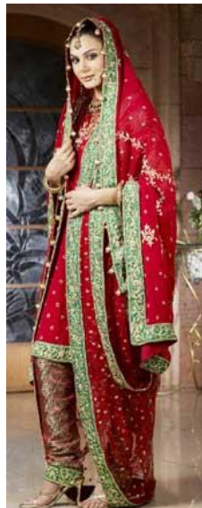
Fig 6- Khada Dupatta