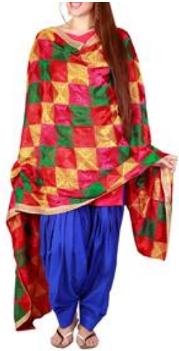
Fig. 3 Punjabi Suit