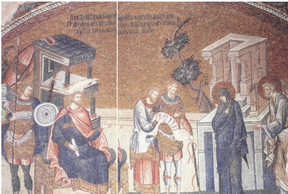
Fig. 5. Census before Quirinius . Mosaic from Chora.

Architectural elements of baroque complication appear, with many people whose attitudes are elegant and expressive (Delvoye, p. 224). Special qualities are given firstly by the technique of execution namely the mosaic (Greco, 2011, pp. 454-455). The colouring is bright, made on gold background and blue and red are the predominant colours.