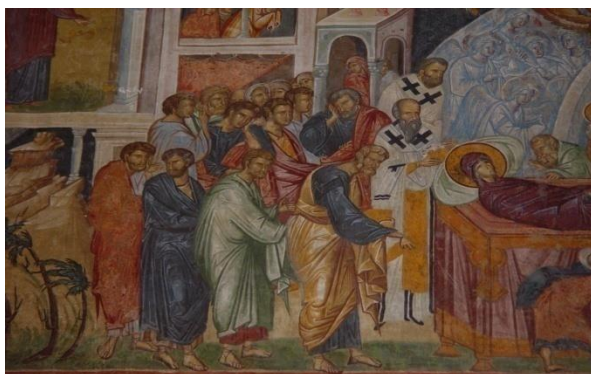
Fig. 7. Assumption. Detail.

It is a unit composition, where one can see that the craftsmen who portrayed it sought to solve various technical problems preoccupying them, for example, to the left of the painting, there are attempts to harmonize the main colours through complementary tones. A wide range of colours and shades were used, from the grayed black of the background to the airy blue of the choir of angels and seraphims surrounding the slumbering with torches, singing (Figures 7, 8). The scene was done with much feeling and warmth, including the attitudes and the expression of grief and pain that they gave to the figures of the women and of the apostles; one can see that they tried to give it a pronounced pathetic character (Mihail, p. 176).