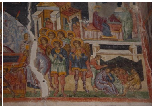
Fig. 8. Assumption. Detail.