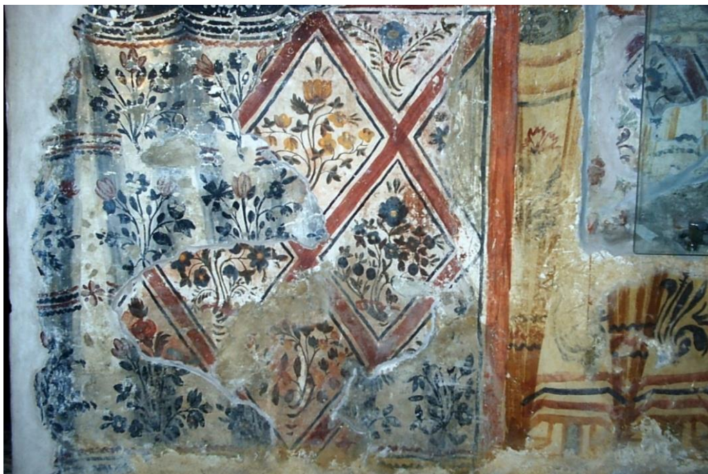
Fig. 1. Church Sf. Nicolae Curtea de Argeș. The three layers of paintings. Photo 2006.

Virgil N. Drăghiceanu (p. 4) is of the opinion that the one who completely finished the church, painting it, was Radu Negru-Voda, Vladislav's brother (Drăghiceanu, p. 4). However, Grigore Ionescu believes that it is only an interpretation of the tradition, also claiming the idea that it was probably him who finished the painting (Ionescu, 1940, pp. 32-35).