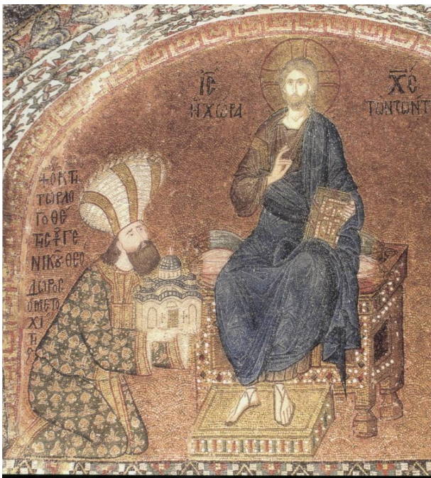
Fig. 3. Votive painting, Chora.