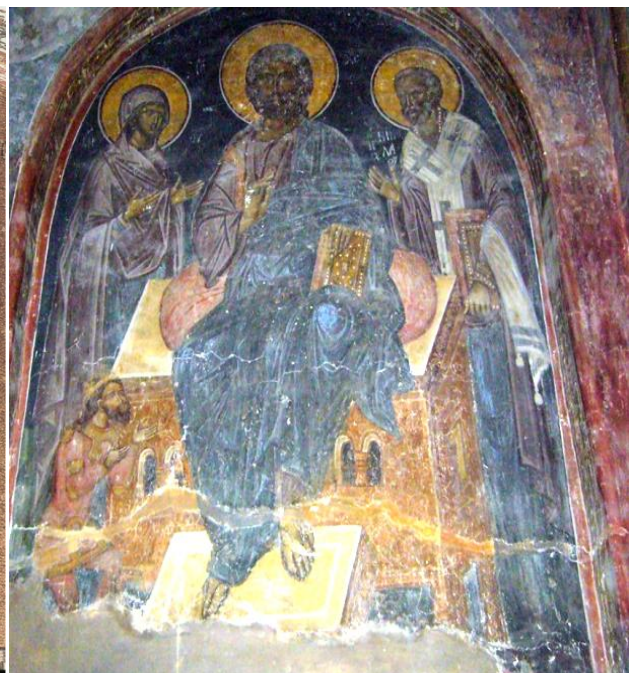
Fig. 4. Votive painting, the nave