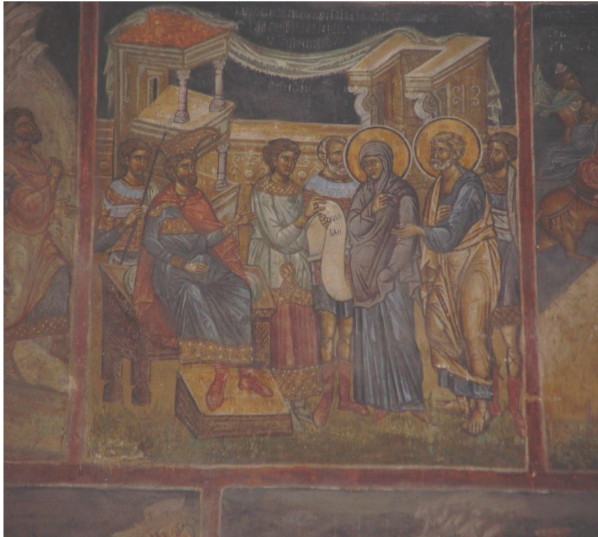
Fig. 6. Census, Biserica Domnească Sf.

Nicolae Curtea de Argeş.