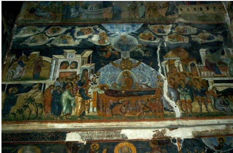
Fig. 9. Assumption of Mary.

The painter who executed the scene in Curtea de Arges was not limited only to the central part taken from Chora, extending it by adding details to the left and right sides of the composition as well as the one in front of the bed. The backgrounds with the architectural elements are present both in the Byzantine mosaic and in the fresco at Arges. Christ's figure receiving Mary's soul is represented at Arges facing the image of the Mother while in Chora we see Him sitting, from the back, looking at Mary.