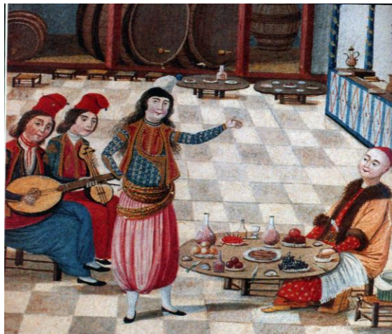
Fig 4. 'Kaba Saz Ensemble' A picture from Hubanname ve Zenanname written by Enderûnî Fazıl

Kemeñçe and tırnak kemane , which are the members of pear shaped instruments family, and was at the back of society mind of Kastamonu and around in 18 th century as instruments used for accompanying to dance. First documents about kemeñçe were the writing work of Hızır Ağa rebab , keman , keman-ı kıptî and ıklığ , Tevhim ül-makamat fi tevlid en nagamat (Hızır Ağa, 1749, 21b, 28a) and travel books of some itinerants who came to visit country. Calling kemeñçe as lyra in these travel books shows the stubborn of their image and type what was registered in their memory. Historical documents proves that kemeñçe was an instrument which was played as 'kaba saz' in coffeehouses, pothouses and used for fun music in 'köçekçe', 'tavşanca' and 'Rumelia musics' in the end of 18 th century and second half of 19 th century. Kemeñçe and lavta is played together at an old Istanbul pothouse in embroidery of Enderuni Fazıl work of Hubânname and Zenannâme , either a song was being sung or a rabbit plays (Figure 4).