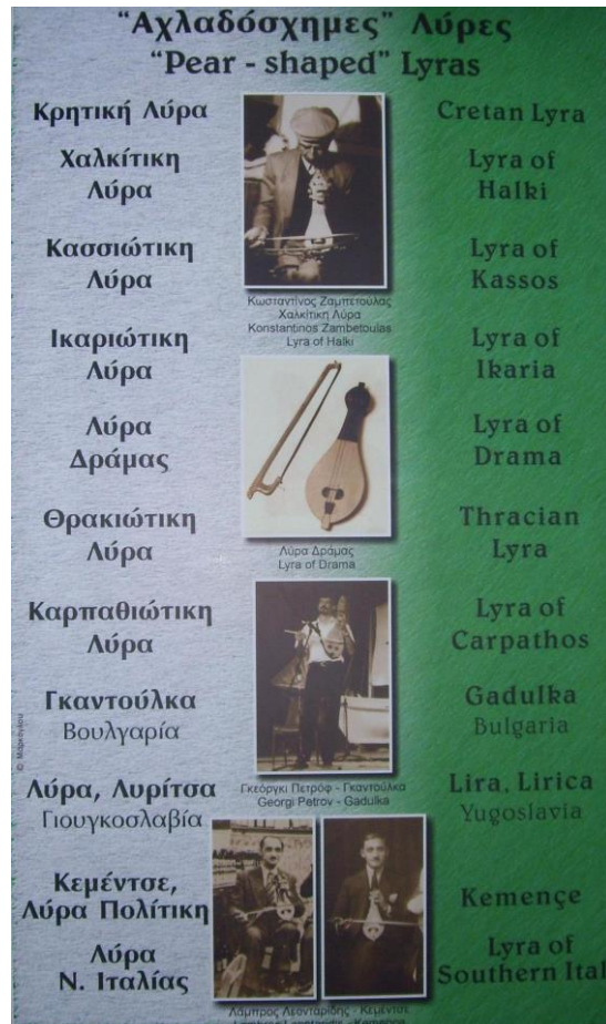
Fig 2a. A poster from Labyrinth Musical Museum in Crete