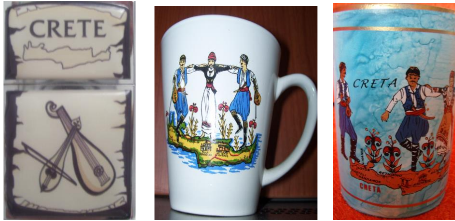
Fig 3. A lighter and cups bought from Dedalu Street in Iraklion in Crete from a touristic shop in July 2007.