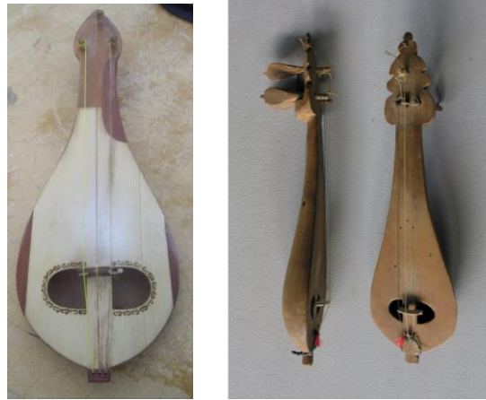
Fig 5. Tırnak kemane made by Mehmet Çelikel from Kastamonu and Yörük kemane from collection of Güner Özkan

around was at the back of its region with the same period of kemençe by type and performing, and keeps its place today too. But it is known Yörük kemane was played by Turkmen / Yoruk tribes and continued its usage by decreasingly until 1990's so it was removed of plating except the local regions (Figure 5). Instrument became integrated with the migratory identity of society and removed of playing when the migratory life replaced with settled life. This situation was the indicator that instrument was at the back of minds this identity.