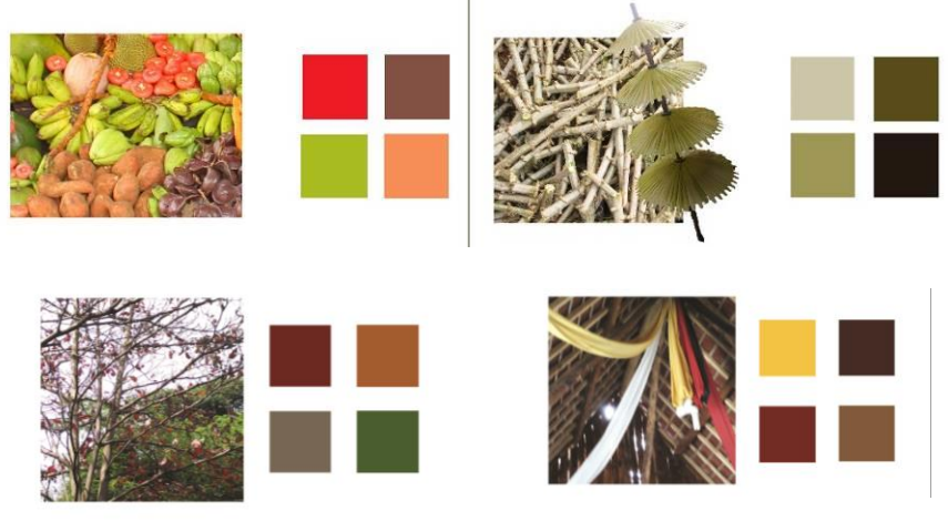
Fig 9. Color Board