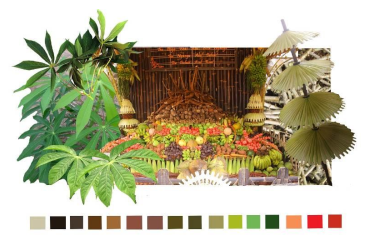
Fig 3. Image Board "Batik Circundeu's Story"

The theme "Batik Circundeu Story" shows in the image board represents the forms of traditional village communities of Circundeu tradition that has been set in advance and then used as a design reference.