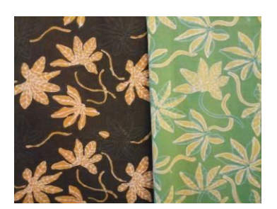
Fig 1. Circundeu's Batik Motif

Cirendeu motif created by Dadang (the 3rd winner of Batik Motif Competition) more representative of indigenous peoples Cirendeu village located in the area Leuwigajah, South Cimahi. Cassava has been a substitute for rice as the staple food for the local community for 80 years, has been the inspiration for Dada to create the motif. So, in this Cirendeu motif, cassava and cassava leaf motif dominates (Ramadan, 2013).