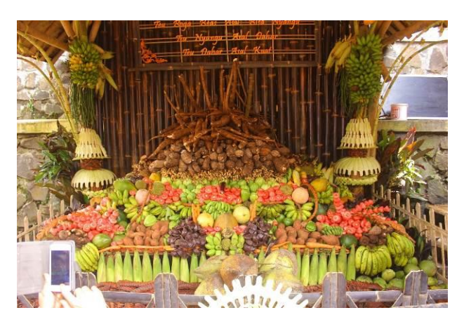
Fig 2. Gunungan Suraan